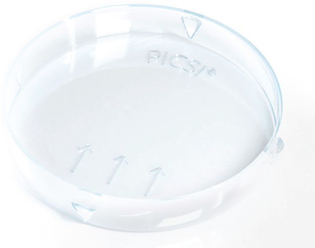
Figure 1: The PICSi® Dish: arrowheads indicate the location of the three microdots of HA

Spermatozoa are then obliged to migrate towards the SpermSlow via the bridging medium, those able to bind to HA becoming caught in the three-dimensional net of SpermSlow. Hence, those spermatozoa that progress freely through the SpermSlow are ignored whereas those whose progress is arrested at the interface between the SpermSlow and bridging medium are selected and assessed for normal morphology before being manipulated for microinjection.